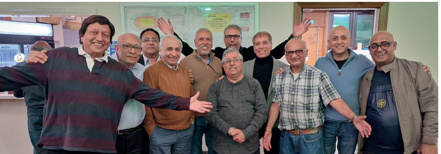
Old Darji Cricket Club Players at FC