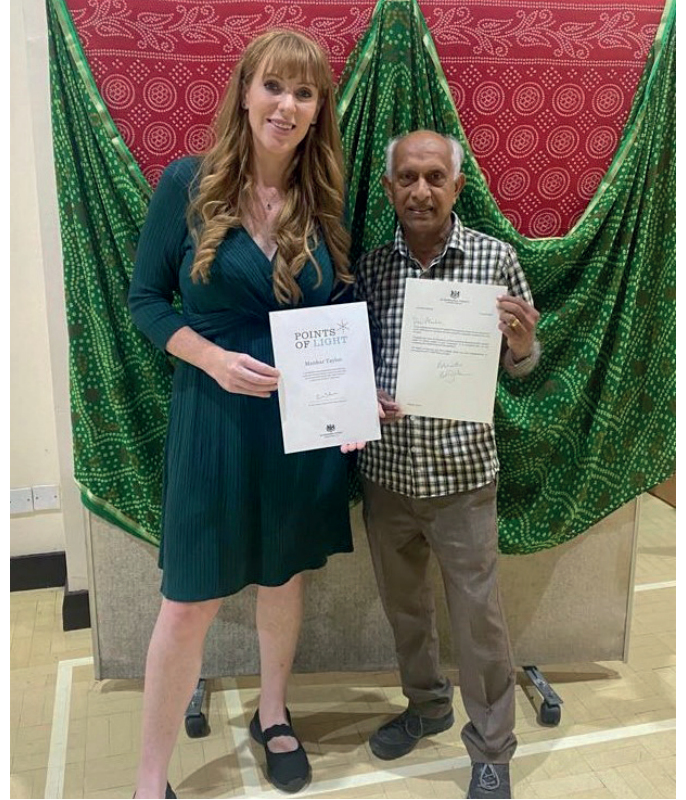
Local Labour MP Angela Rayner presenting award.

He did this at the age of 69 and again at 71 years of age followed the footsteps of Mahatma Gandhi who led a successful non-violent campaign for Indian independence, and he took this route to cycle to raise money – pedalling the 440km from Ahmedabad to Dandi.