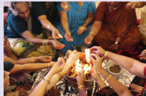
Havan & Bhajans 2010