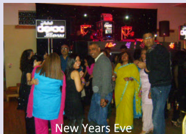
New Years Eve