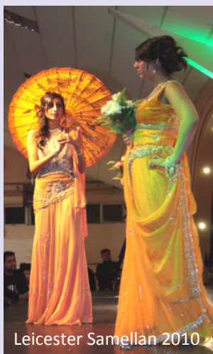
Leicester Samellan 2010