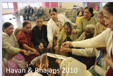
Havan & Bhajans 2010