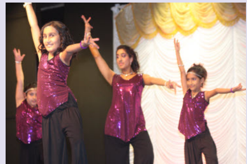
Leicester Samellan 2010