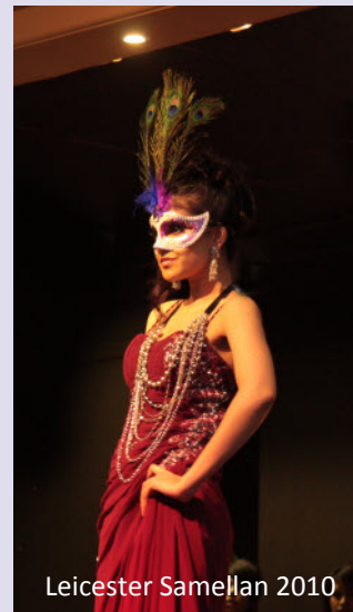
Leicester Samellan 2010