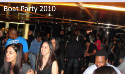
Boat Party 2010