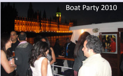
Boat Party 2010