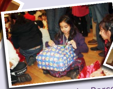
Caught with the Parcel