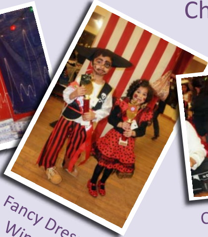
Fancy Dress Winners