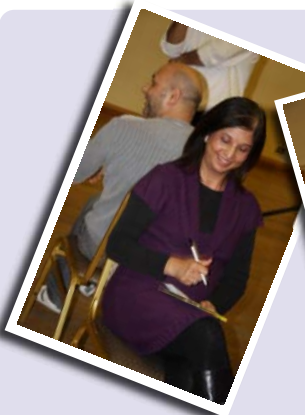
How much do you know about your partner?