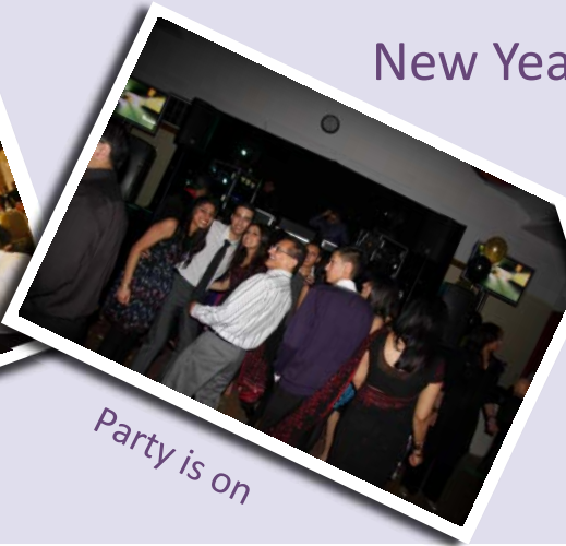
Party is on